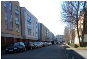
Looking down Hart Street

We know as do all residents of the area that grid lock frequently occurs, especially when McDonalds is busy and when events or films in Lockmeadow start and finish. The